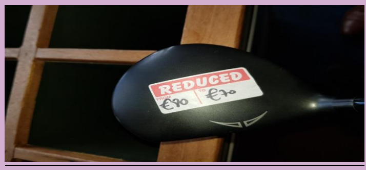
PING G25 3 AND 5 WOOD, REG SHAFT, WERE €280 NEW NOW SELLING FOR €70 EACH