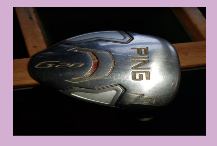
PING G20 7 WOOD, NOW ONLY €50