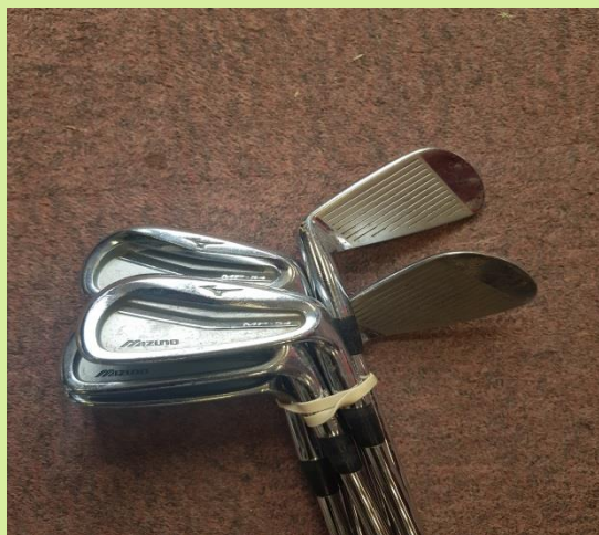
Mizuno MP54 Irons, Mens 4-PW Only €150