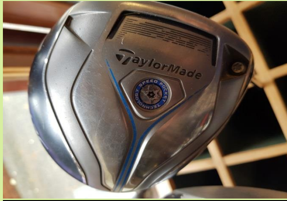
Taylor Made Jetspeed Driver, great Condition only €80