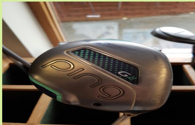
Ladies Ping GLE Demo 5 wood – Only €95