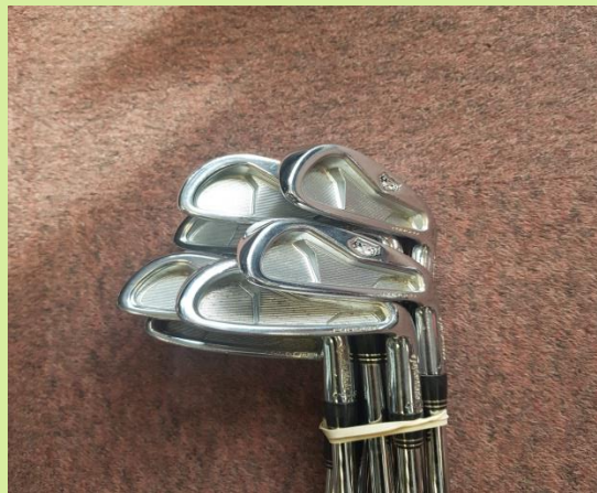
Taylor Made RAC Irons, Mens 3-PW Only €150