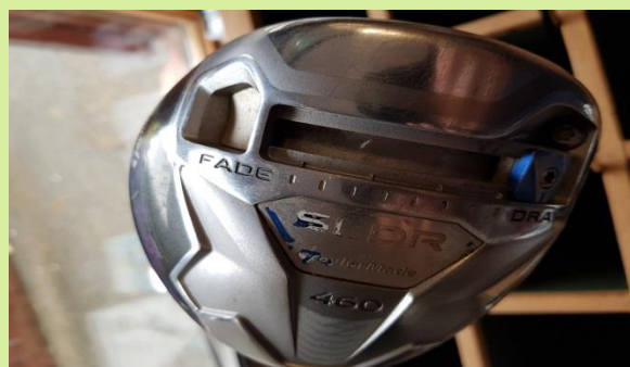
Taylor Made SLDR Driver – Now Only €60